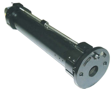
Electronic Bore Sighting Unit