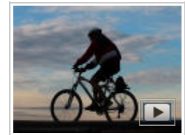
Vibrating bicycle senses traffic