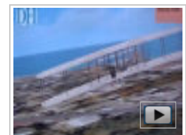
You can fly Wright here

Subscribe - Deccan Herald's YouTube channel